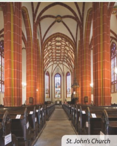
St. John's Church

Tip: An organ recital can be booked in St. John's Church for € 4 per person.