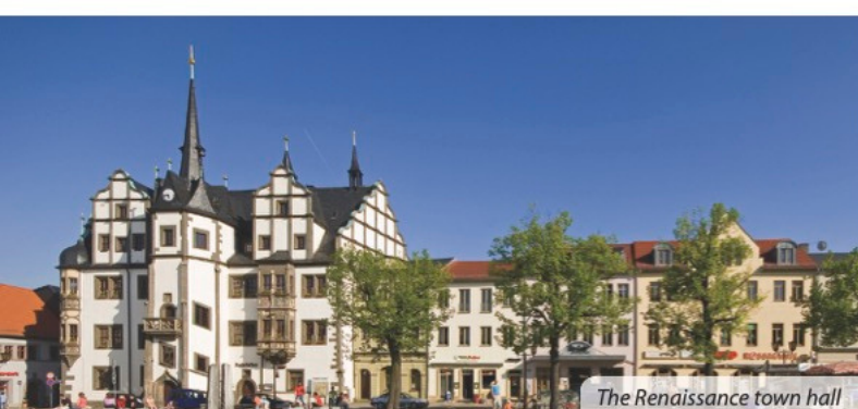
The Renaissance town hall